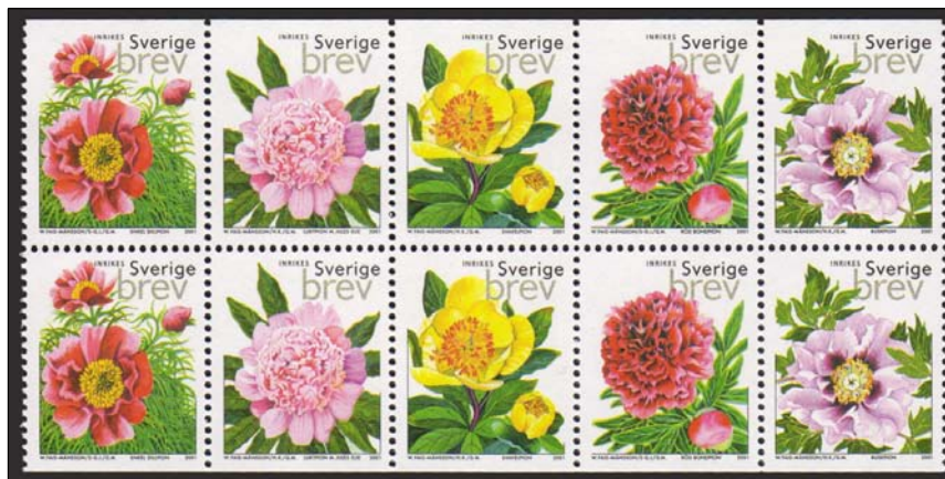
All stamps on the top row = Michel "D". All stamps on the bottom row = Michel "D". Each vertical pair from the pane = Michel "D/D"

Booklet stamps may exist with two opposite sides imperforate, a third side imperforate, or all sides perforate (with or without margins).