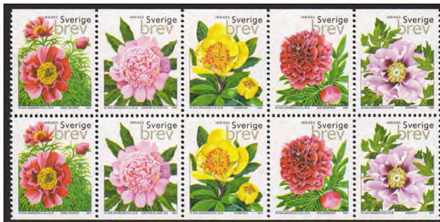
All stamps on the top row = Michel "D". All stamps on the bottom row = Michel "D". Each vertical pair from the pane = Michel "D/D"

Booklet stamps may exist with two opposite sides imperforate, a third side imperforate, or all sides perforate (with or without margins).