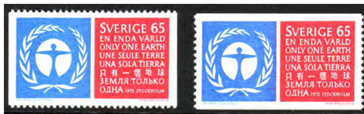
Left stamp = Michel "A". Right stamp = Michel "C".

The following illustrations should assist in understanding perforation varieties and collecting patterns of Swedish stamps.