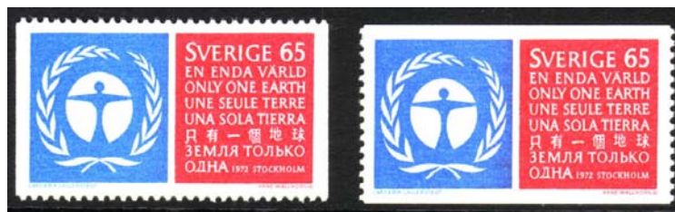
Left stamp = Michel "A". Right stamp = Michel "C".

The following illustrations should assist in understanding perforation varieties and collecting patterns of Swedish stamps.