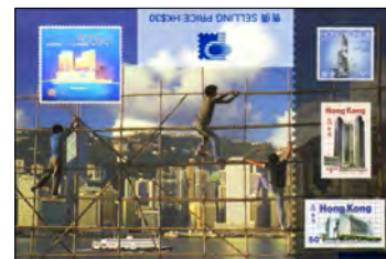
Illustration shows packet cover

15-33 Prestamped Postcards Packet of 5 or 6 cards in original sealed packet for: Hong Kong '97 World Stamp Expo Still sealed in original pack and what is visible is pristine Very nice postal stationery Original Cost HK$30 = ~A$6